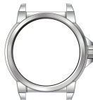
High Quality Stainless Steel Watch Case